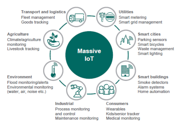
Figure 1 - IoT Use Case Diversity