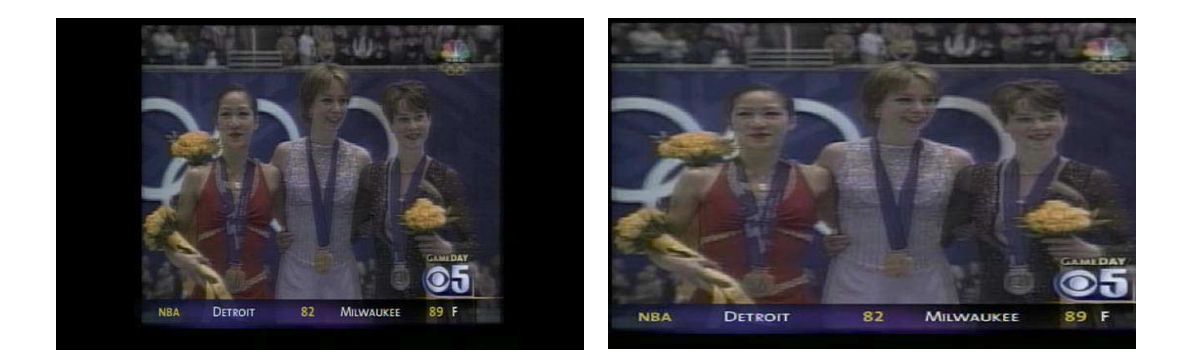
Fig. 4: Example of standard definition stream stretched by television to 16:9 screen.

Satellite and broadcaster alternatives provide a clear indication of what type of feed is broadcasted to avoid this confusion. An alternative for cable is to organize channel line-up per stream format to avoid the confusion, independently from the content when multicasting involves both types of streams on same channels.