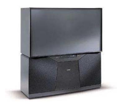
Fig. 3: Mitsubishi cable ready TV – WS55909.

from the content provider, and that it would be prepared to support carriage of PSIP information when made available from the content provider in accordance with the agreement. CEA agreed with the document. The agreement also specified mandatory/optional PSIP tables to carry on the cable plant while recommending standards to overcome implementation issues. For more information on NCTA\CEA agreement specific to PSIP, refer to ATSC A/65 and SCTE DVS-097 standards.