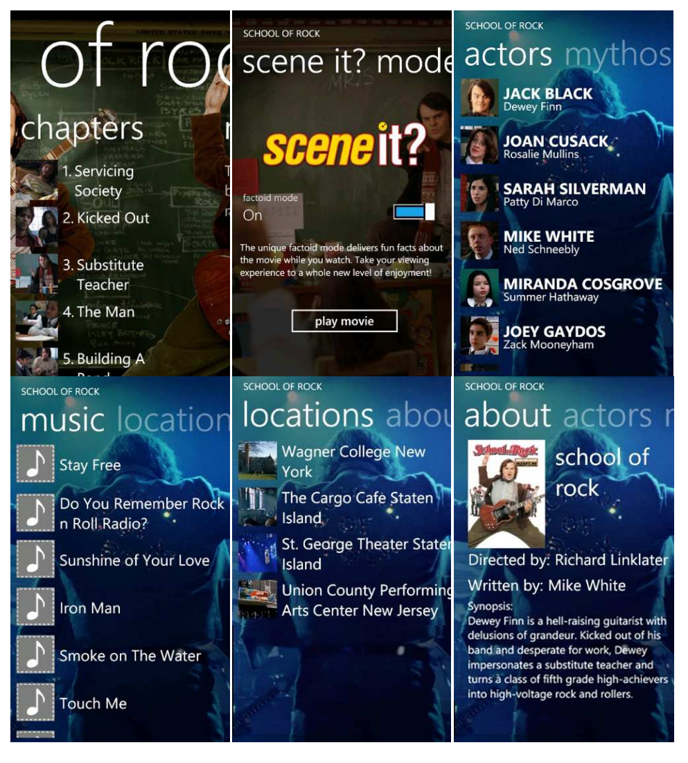
Figure 3: Second screens

With the growing popularity of connected devices, actionable, accurate metadata is needed to deliver the interactive applications that users have come to expect.