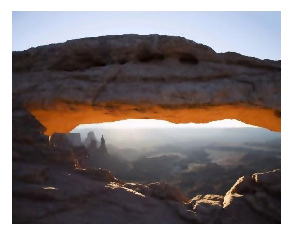
Figure 3 – Compression by Pre-Processing and High Frequency Pixel Filtering