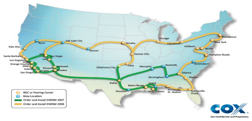
Figure 2 -- Map of Cox's Backbone Network

wavelengths that can be used for protected services or that can flexibly be assigned as needed for unusual circumstances. While each potential disaster cannot possibly be anticipated, it is good to note that some outages can be recovered from rapidly with a flexible DWDM network design that can provide end-to-end, any-to-any connectivity between all nodes on the network. The network that emerged from these design considerations is shown in Figure 2, below.